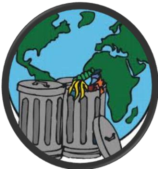
Solid Waste Services